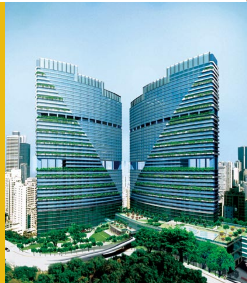
Mega Tower Hotel in Wan Chai (under planning) 位於灣仔的 Mega Tower Hotel (計劃中) ▶