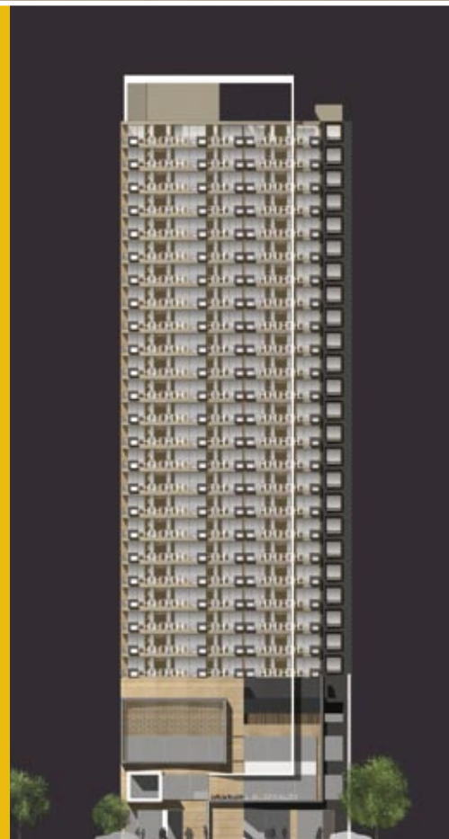
Service apartment project at 214-224 Queen's Road East, Wan Chai (under construction) (left) 位於灣仔皇后大道東214-224號服務式住宅項目(興建中)(左) ▶