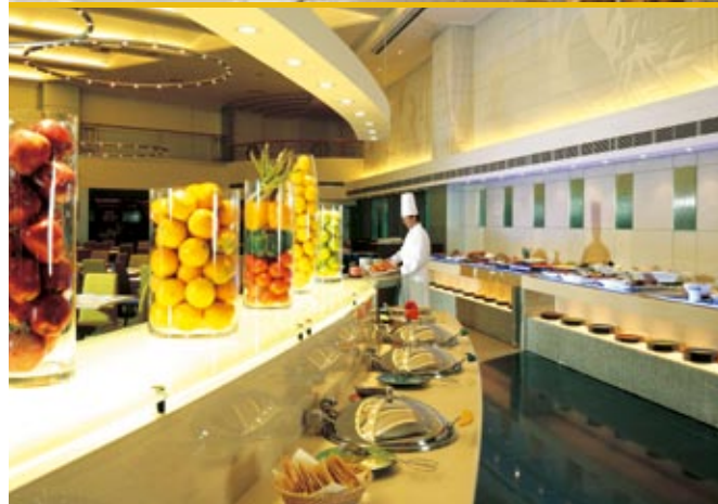
◀ Coffee shop at Panda Hotel in Tsuen Wan 位於荃灣悅來酒店的咖啡廳