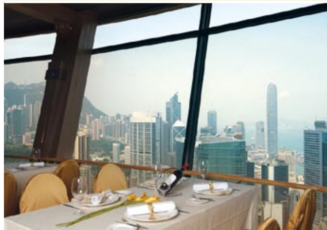
◀ R66 Revolving Restaurant at Hopewell Centre, Wan Chai 位於灣仔合和中心的R66旋轉餐廳