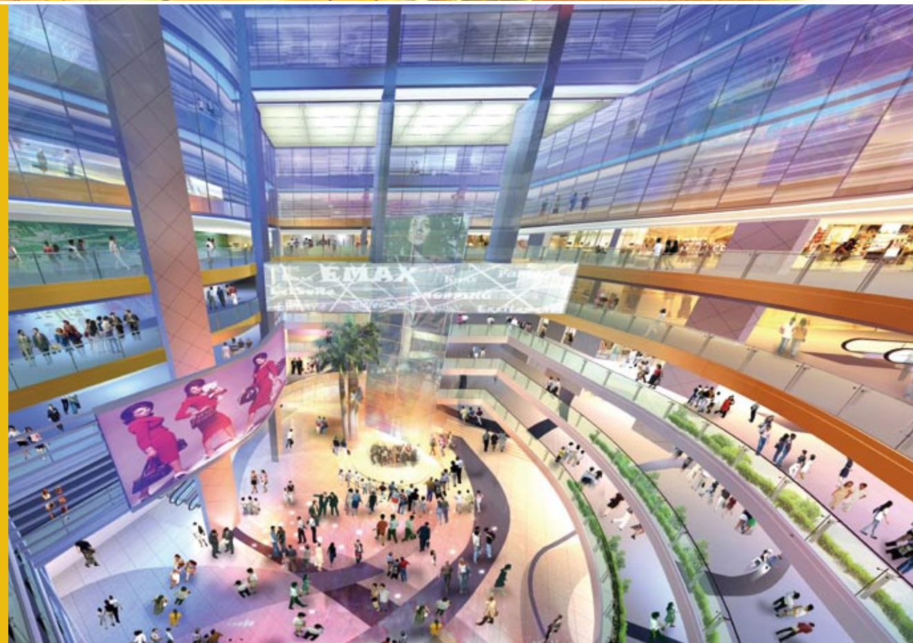
◀ EMax in Kowloon Bay 位於九龍灣的EMax