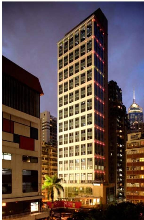
◀ QRE Plaza in Wan Chai 位於灣仔的 QRE Plaza